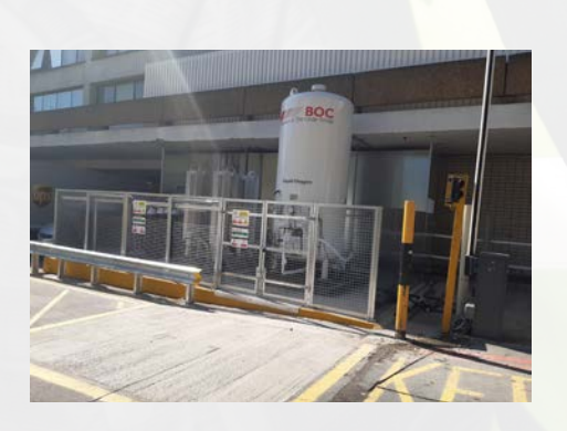
Guys & St Thomas NHS Foundation Trust

Oxygen Line installation at St Thomas' Hospital.