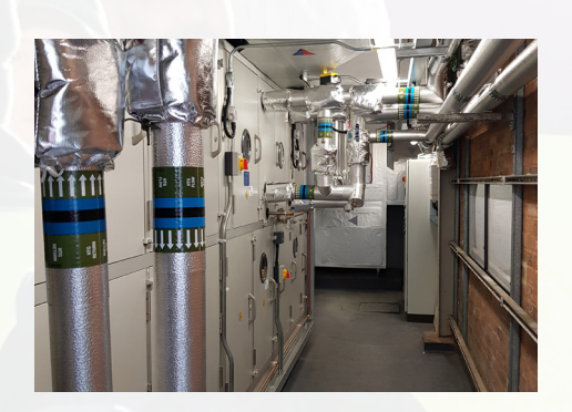
Royal Marsden Hospital AHU Installation