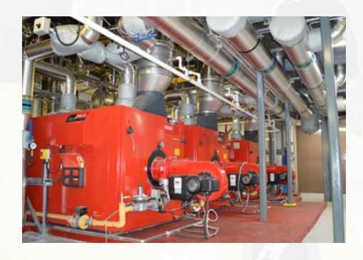
University of Greenwich Boiler Plant Replacement

Oxygen Line installation at St Thomas' Hospital.